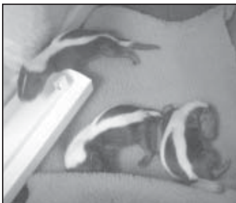
Three good reasons to help support the Wildlife Center