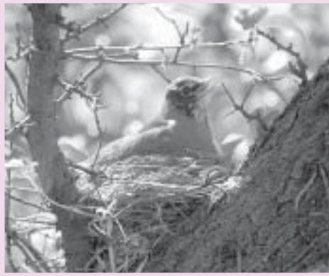
American Robin sitting on Nest