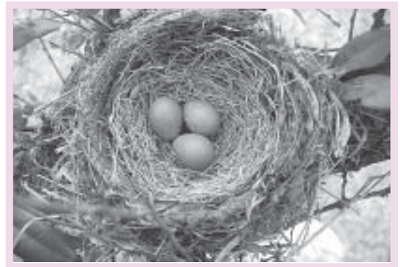
American robin nest and three eggs

Robins are often one of the first birds to sing in the morning and at dusk and sometimes even throughout the day.